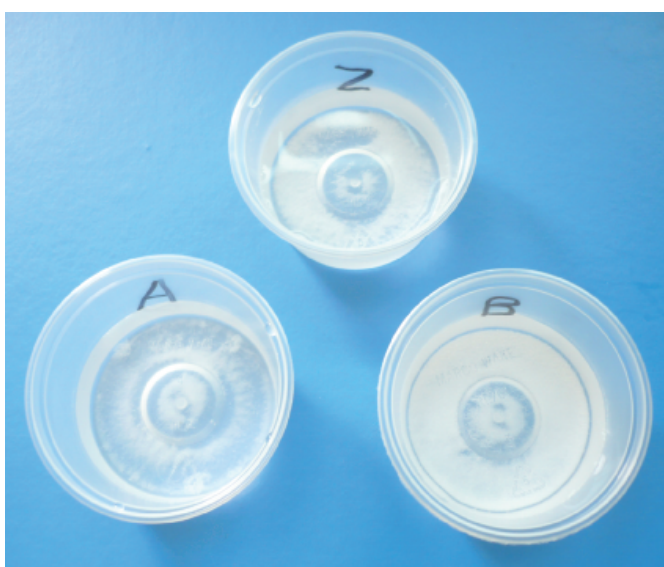
Fig. 2. Incomplete dissolution of stavudine capsules in water (Z = Zerit, A = Aspen Stavudine, B = Stavir).

The contents of Stavir capsules were extremely difficult to disperse in water despite prolonged agitation. Their contents appeared to be partially hydrophobic, floating persistently on the meniscus of the sample. Consequently, recovery of active drug was reduced (Table I). However, because of the small sample size, the difference in recovery of active drug from solution when comparing Zerit with Stavir did not reach statistical significance ( p=0.1730 ).