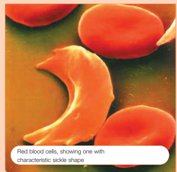
Red blood cells, showing one with characteristic sickle shape

In respect of Sickle cell disease, so named due to the sickle shape of the red blood cells, the carrier state is believed to prevent infection by the malarial parasite thereby conferring partial immunity to the carrier. However, the full blown disease state can be a fatal condition if left untreated.