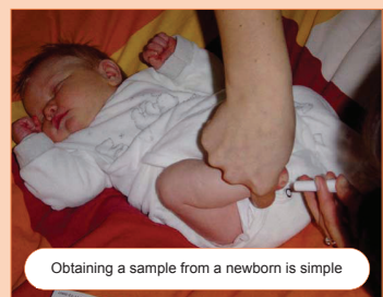
Obtaining a sample from a newborn is simple

The Dutch government has already agreed that it should be offering this type of screening but have yet to "go live". We have an ongoing Vnbs evaluation being conducted between Leiden Univer-