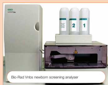
Bio-Rad Vnbs newborn screening analyser

By using a small amount of blood taken from a heel prick onto a special filter paper (Guthrie card), it is readily possible to screen babies for a number of treatable but life threatening diseases. Very many countries already offer a "Newborn Screening" program for diseases such as congenital hypothyroidism ( inadequate thyroid hormone production ) and Phenylketonuria ( missing an important amino enzyme, can cause severe mental retardation ) but not Sickle cell disease.