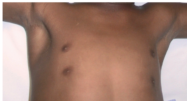
Fig. 3. Ventral aspect of the proximal anterior chest cage, demonstrating the two sets of nipples.